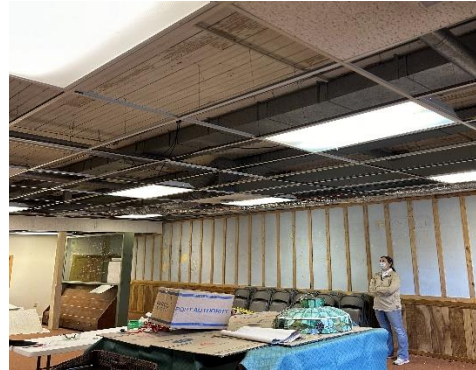
Early days. Beth inspects the start of demolition.

painted, holes patched and soon the electric lighting will be replaced and the walls painted!